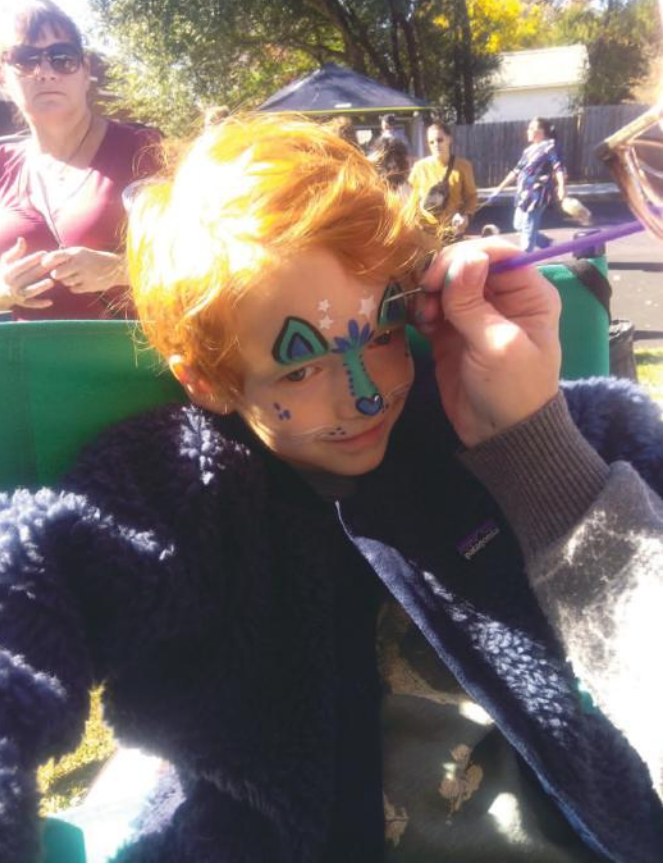
The hair color is natural while a young visitor gets his face painted, a longstanding tradition for kids (and some adults) at the Autumn Affair.