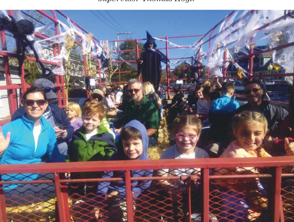
Everyone is all smiles (even the witch) for a hayride around Main Street, not being in a hurry to get anywhere while getting a unique view of the country-style fair.