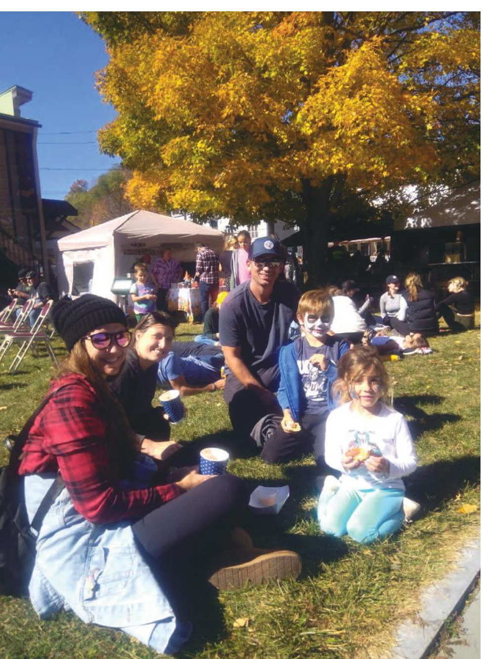
Groovin' on a Saturday afternoon on the autumn-sun-soaked lawn of the Centre Church, a perfect day and perfect way to enjoy the event with live music playing in the background.